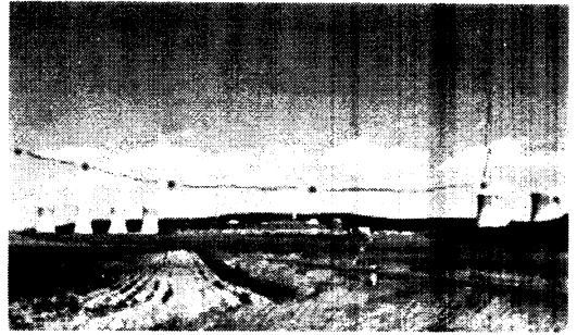
Fig. 1. The plant with the object path drawn in

Ted Phillips, Center for Physical Trace Research