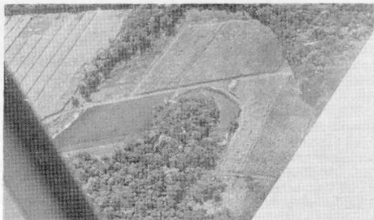
Two aerial views of the Horseshoe Lagoon, near Tully, Queensland

flattened reeds in the "nest" had turned noticeably brown, but only on the upper surfaces . The underside of each reed nearest the water still remained quite green. This "browning" of the upper surfaces of the reeds had quite obviously taken place since 9 a.m. that morning.