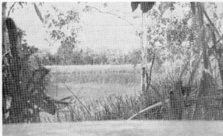
The Lagoon from over the top of the monitor camera

On March 4, two days later, quite a number of local inhabitants reported the passage of another UFO. An inspection of the monitor again revealed that it had been "triggered", but this time, for some